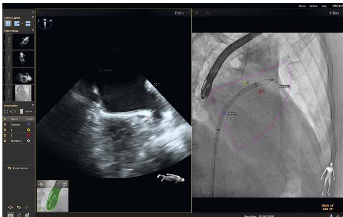
Figure 1. Intraoperative fusion image with calibrated echocardiography and fluoroscopy